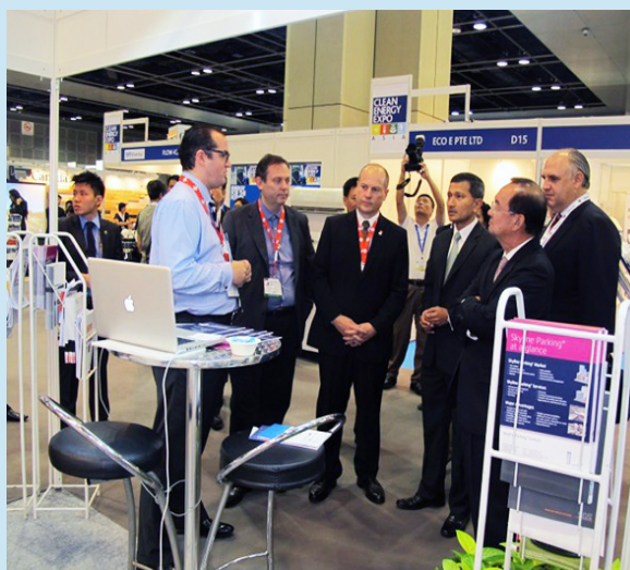
Talks with Dr. Vivian Balakrishnan, Singapore

Minister for the Environment and Water Resources