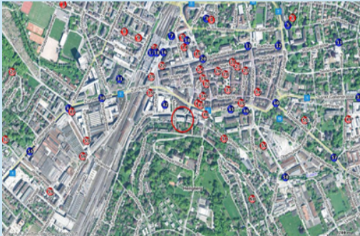
Map of the Area

Skyline Parking AG Lagerhausstrasse 3 CH-8400 Winterthur New Office Phone Number: +41 52 203 00 03