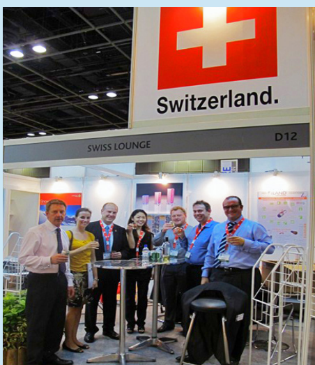
Skyline Parking Booth